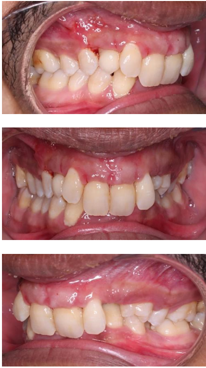
Figure 1: Intraoral photos

The intraoral periapical and Orthopantomogram radiographs revealed bilateral horizontally impacted permanent maxillary canines with the crowns facing each other in a kissing position in midline of the upper dental arch. They were above the roots of upper central incisors [Figure 2 a, b]