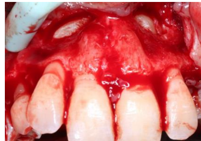
Figure 4: Front view