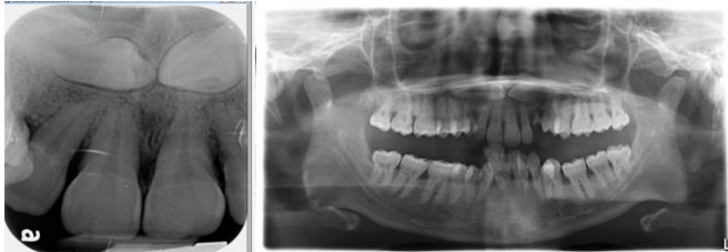
Figure 2: a) Periapical radiograph. b) Orthopantomogram

The intraoral periapical and Orthopantomogram radiographs revealed bilateral horizontally impacted permanent maxillary canines with the crowns facing each other in a kissing position in midline of the upper dental arch. They were above the roots of upper central incisors [Figure 2 a, b]